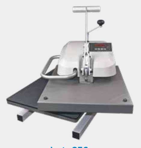
Insta 256 16" x 20" heat platen

Swings almost a full 180° Evenly distribute pressure